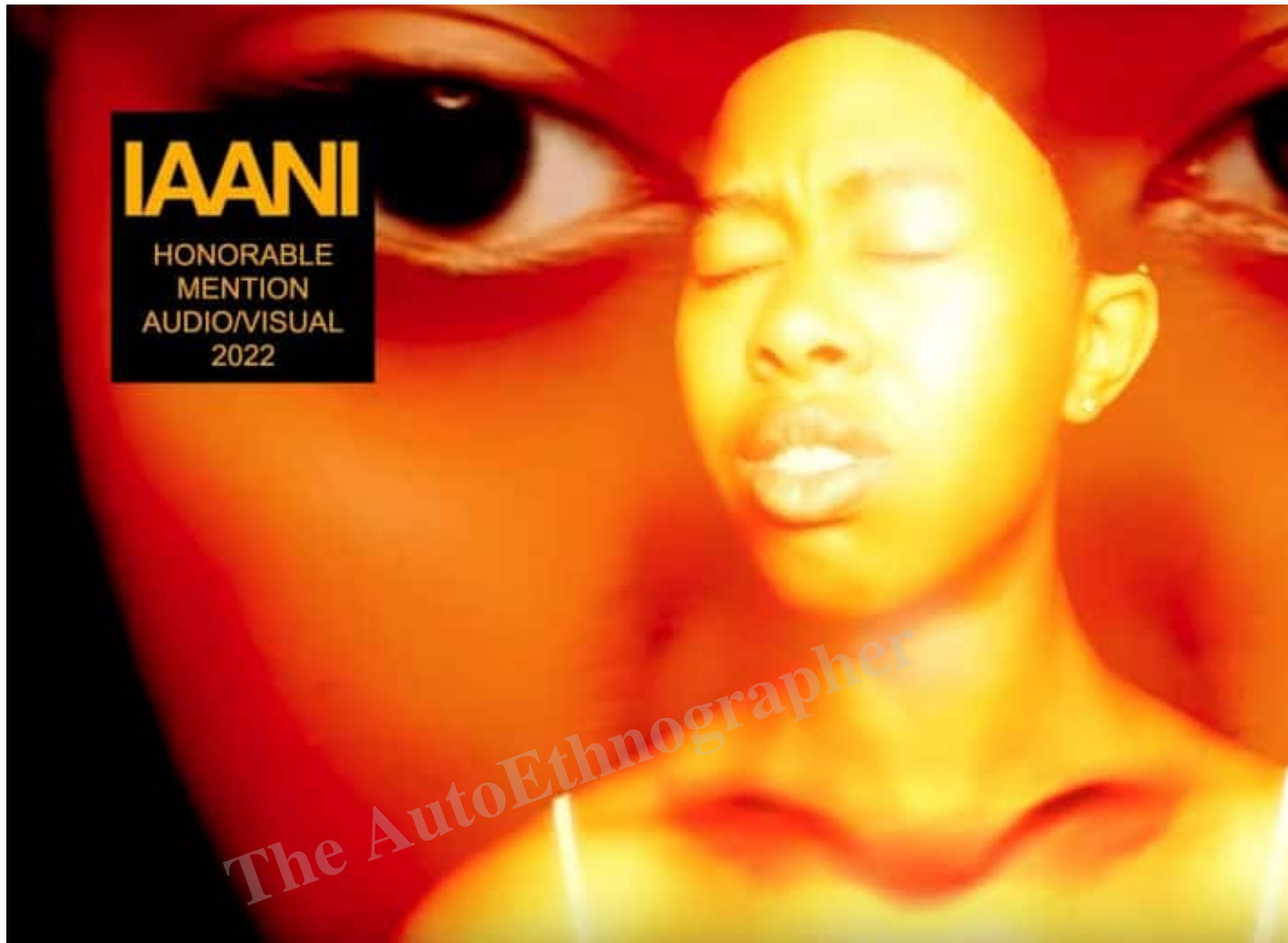
Photo of a face within a face